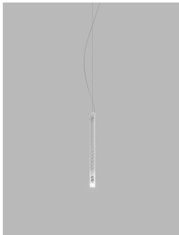
STRDU SP CRRI NN G9 CE